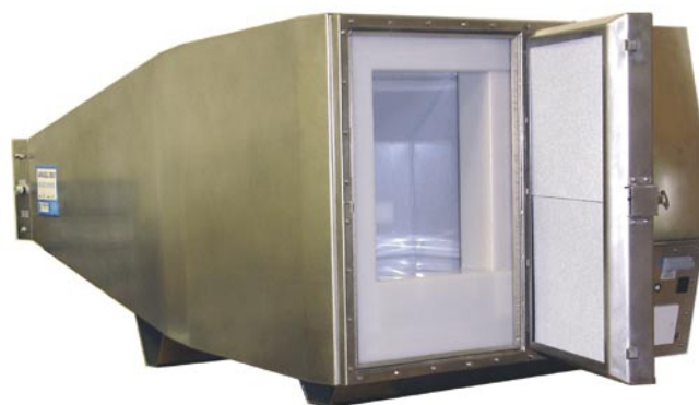
Lc300/2 with access door open

CONVENIENCE. The LaplaCell occupies just one small corner in the lab, yet provides a simple and immediate resource for EMC testing as and when you need it. Testing prototypes or production samples avoids potentially costly and time consuming rectification work at later date